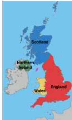
The United Kingdom

Map symbols - a small picture on a map that tells you where something is, like a church, a park