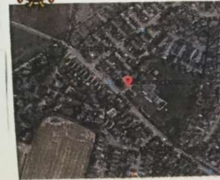
An aerial photograph of our school