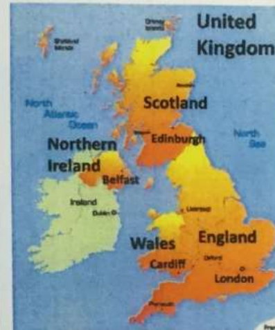
The United Kingdom

Can you identify the human and physical features around our school?